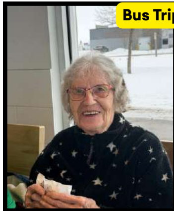
Bus Trip to A&W