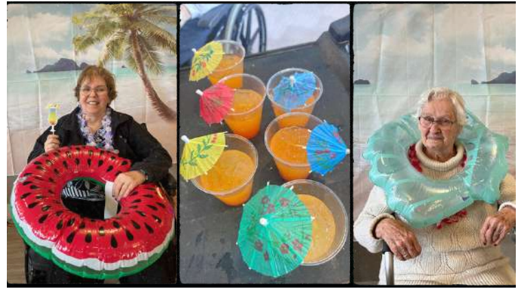
In March we visited Hawaii and Greece for our Passport to Paradise!