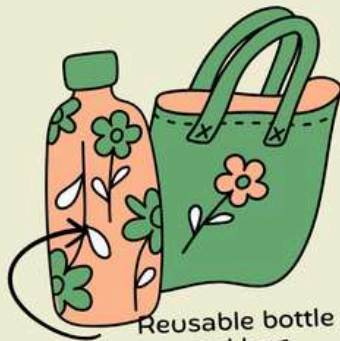
Reusable bottle and bag